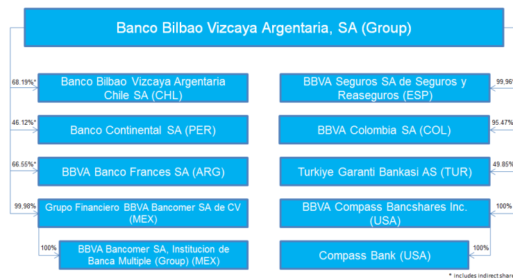
Chart 1: Main subsidiaries and investments of BBVA

The main subsidiaries and investments with BBVA’s total legal shares are as follows: