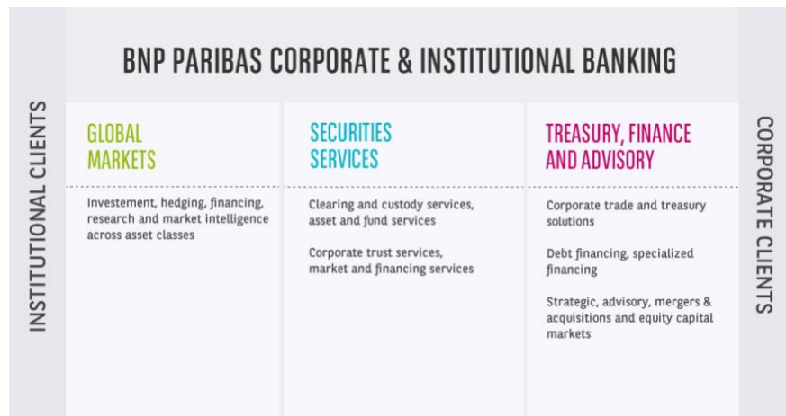
Graph 1: Corporate Structure (Source: Website of BNP Paribas)

BNP Paribas organizes its business into two main fields of activity: Retail Banking & Services (RBS), and Corporate Institutional Banking (CIB). The RBS business is divided into “Domestic Markets” and “International Financial Services”. The other business field, CIB, is a global provider of financial solutions to corporate and institutional clients. The main business activities in the CIB are as follows: